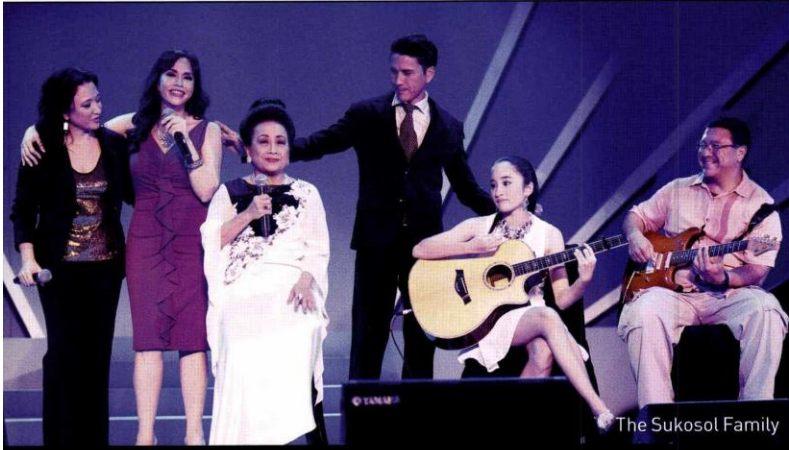
The Sukosol Family